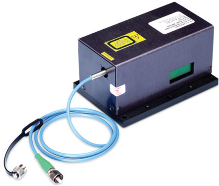
Single Frequency Fiber-coupled Module